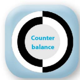
Counter balance for stable operation