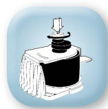
Suspension design for longer switch life