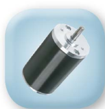
Maintenance free BLDC Motor